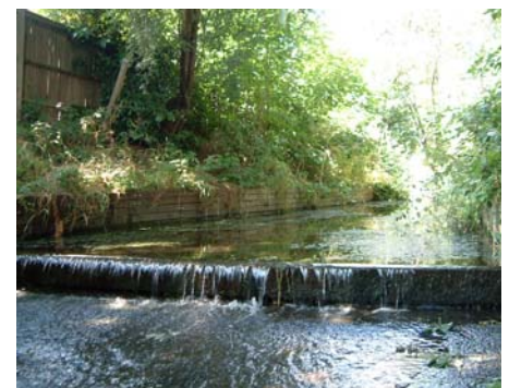
Characterisation of urban watercourses