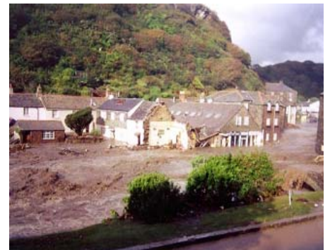
Properties damaged by fluvial flooding